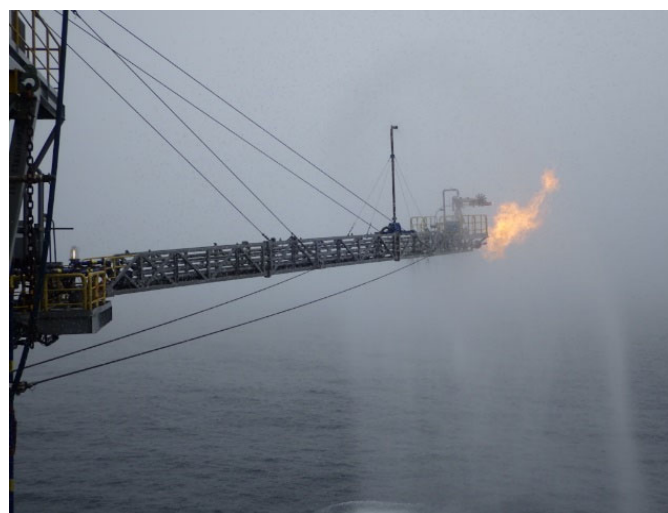
Production test of natural gas